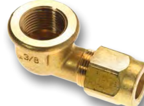
Female adaptor elbow union SO 42521