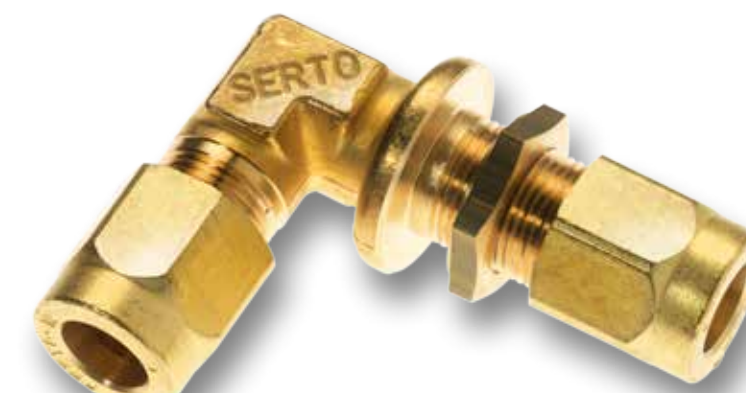
Panel mount elbow union SO 42721