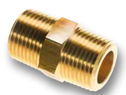
Double nipple AD HN 40