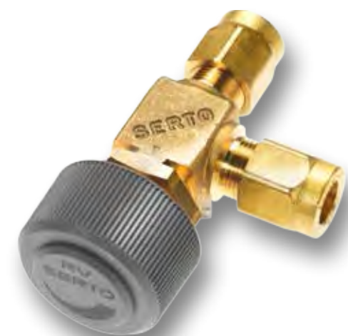
Elbow (fine) regulating valve SO NV 41A21E