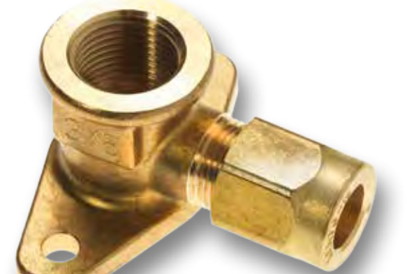
Female adaptor elbow union with wall flange SO 42321