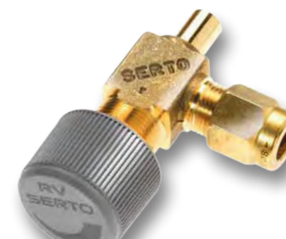
Elbow (fine) regulating valve adjustable SO NV 41A21EL