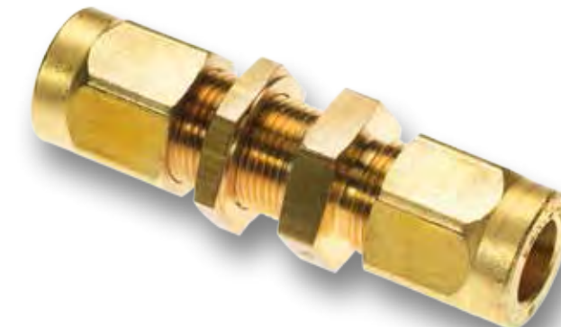
Panel mount union SO 41521