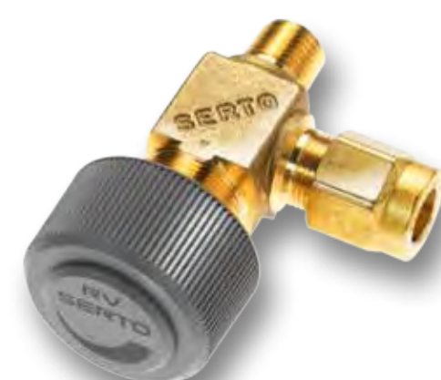
Elbow (fine) regulating valve with male adaptor thread SO NV 41A21EB