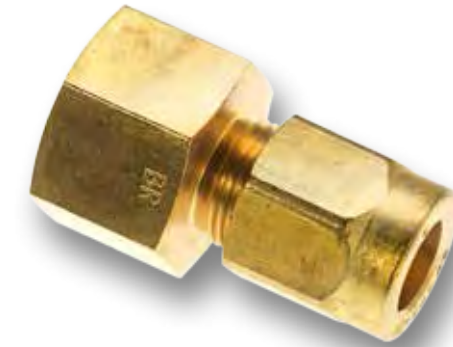
Female adaptor union SO 41221