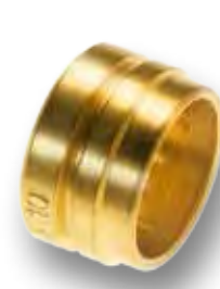
Compression ferrule SO 40001