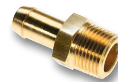
Male adaptor hose nozzle SO 40511