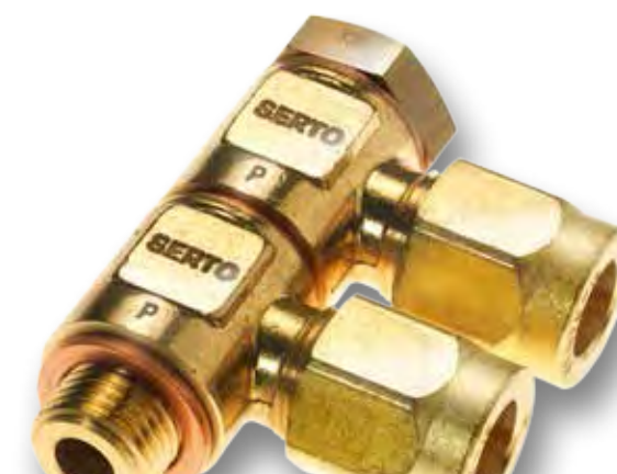
Double banjo SO 42924