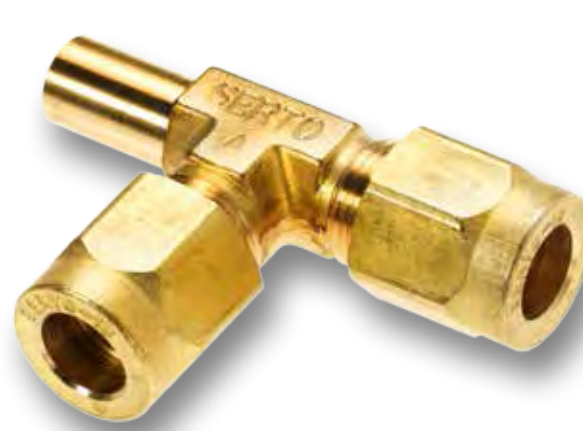
Adjustable L union SO 43621 L