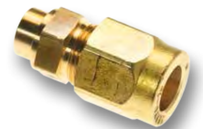
Adaptor union with soldering nipple SO 41421