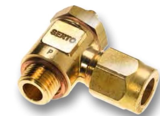
Single banjo with throttle valve SO 47624