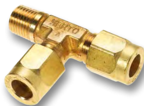
Male adaptor L union SO 43721 L