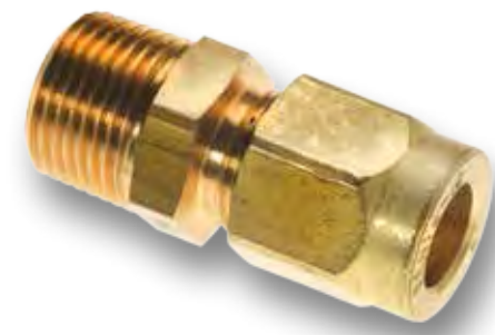
Male adaptor union SO 41121