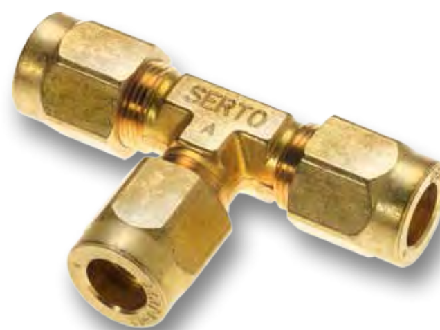
Tee union SO 43021