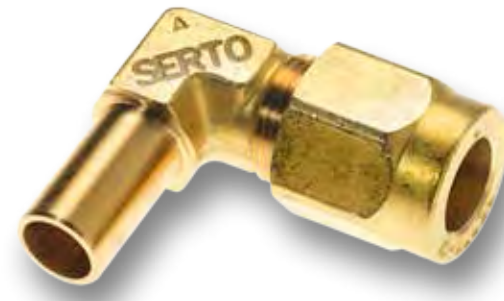
Adjustable elbow union SO 42621