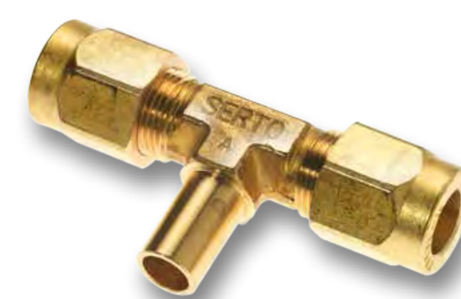
Adjustable tee union SO 43621 T