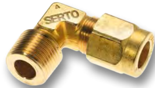
Male adaptor elbow union SO 42421