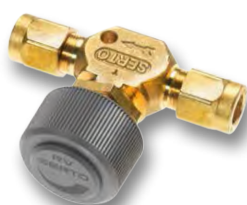
(Fine) Regulating valve SO NV 41A21