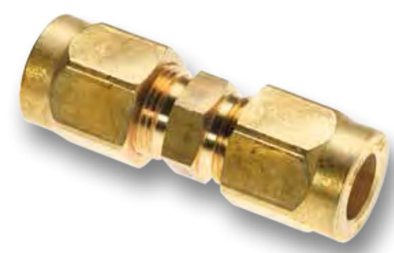
Straight union SO 41021