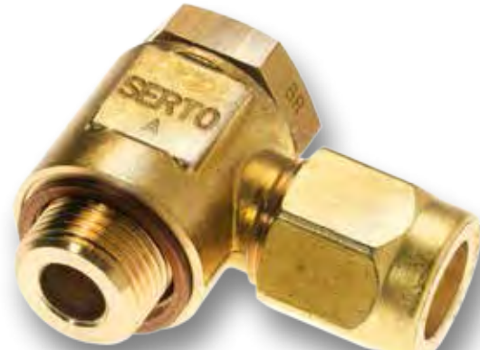
Single banjo SO 42824