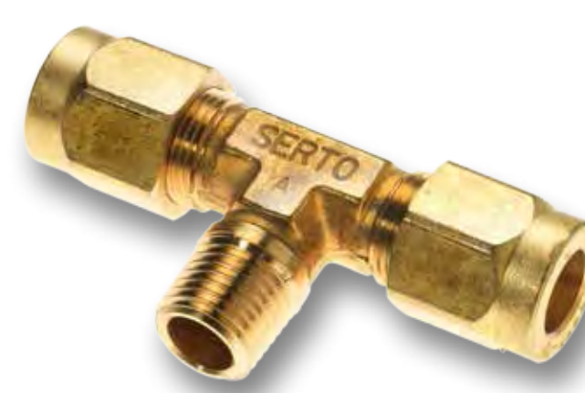
Male adaptor tee union SO 43721 T