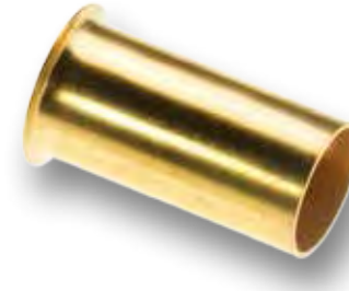
Stiffener sleeve SO 40003