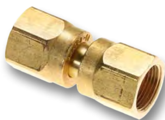
Tube stub assembly SO 41325