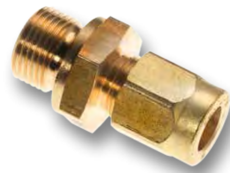
Male adaptor union with edge seal SO 41124