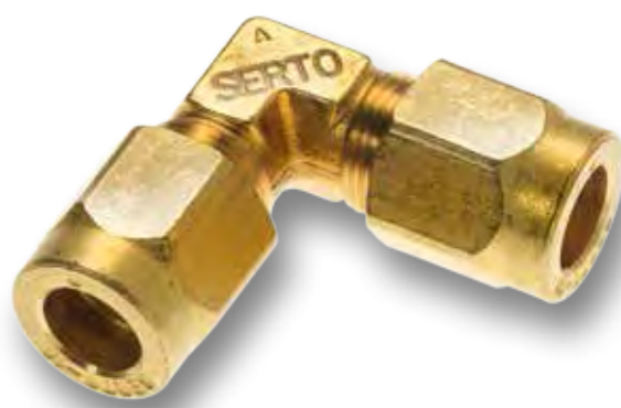
Elbow union SO 42021