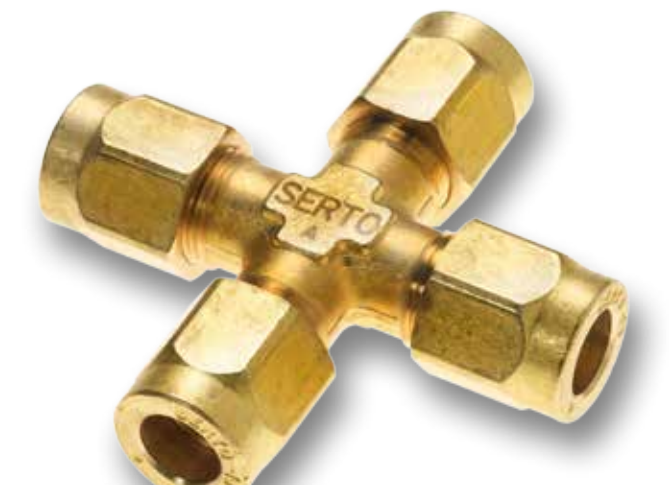
Cross union SO 44021