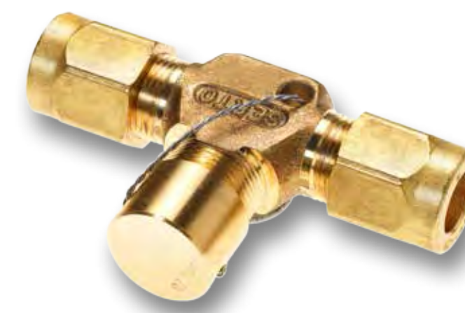
Double action valve SO CV 43C21