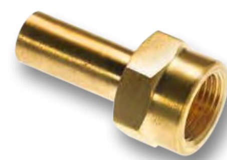
Adjustable female adaptor SO 41704