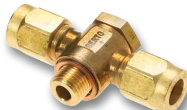
Tee banjo SO 43824