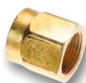
Union nut SO 40020